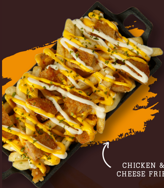
CHICKEN & CHEESE FRIES